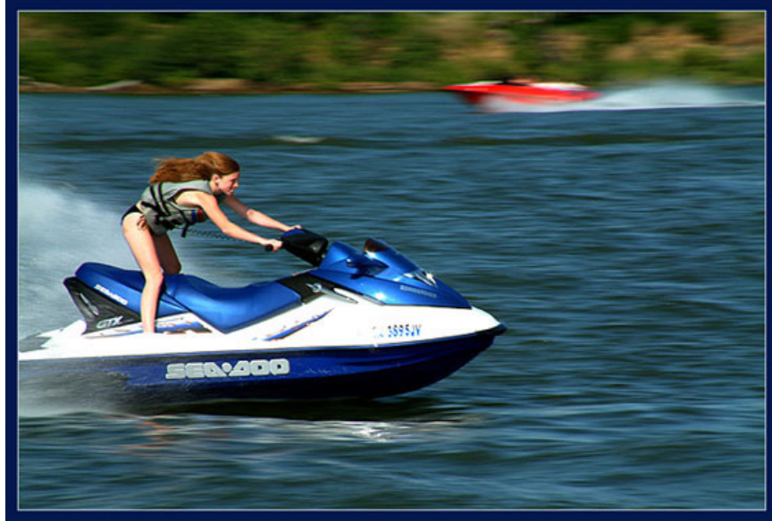
Speed-Doo! 1/125" @ f/5.6 – ISO 160

In this photo, Danny followed the jet ski with the camera and allowed the background to be blurred.