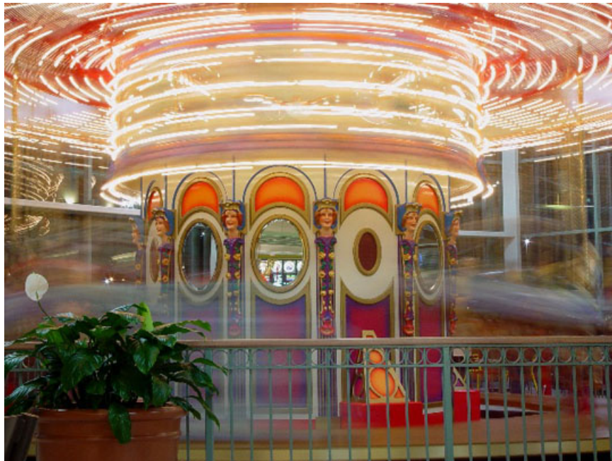
Stallions at the Speed of Light 1" @ f/8 – ISO 100

Mounting your camera on a tripod and using a long shutter speed is one primary method of creating a nice motion effect in your photograph. When your camera is mounted to a tripod, you can create blur on moving objects and keep all the still segments of your photo in nice sharp focus.