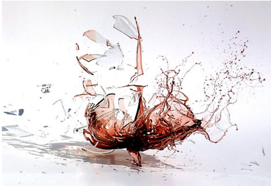
Got Till It's Gone 1/4000" @ f/5.6 – ISO 100

In this photo, Danny used some creative lighting and a fast shutter speed to capture a beautiful splash crown.