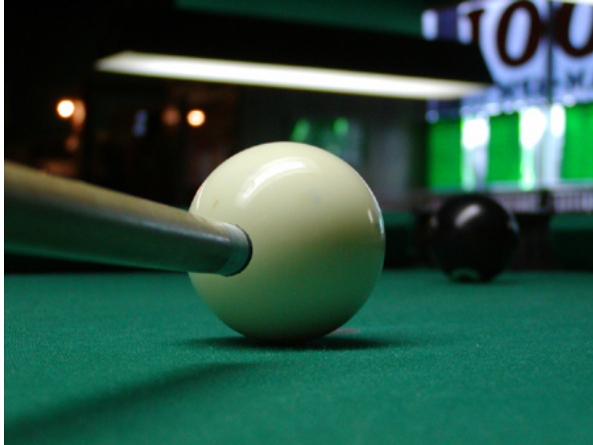
Eight Ball – Corner Pocket 1/25" @ f/3.2 – ISO 100

Langdon created a shallow depth of field on this photo with a large aperture. The depth of field in this photo encompasses the cue ball only. The area in the foreground and in the background fade out of focus.