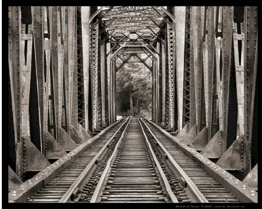
Bridge of Sighs 1/125" @ f/8.0 – ISO 100

This photograph uses a very small aperture to achieve sharp focus throughout the entire image. Everything here is in focus.