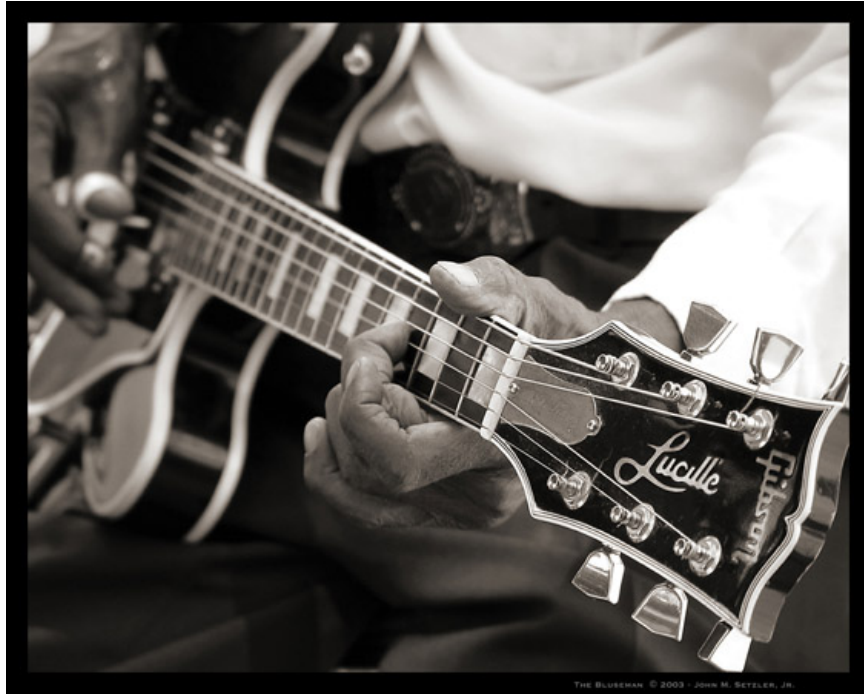
The Bluesman 1/250" @ f/2.8 – ISO 100

In this photograph, I wanted to focus on the guitar player's left hand and bring it to the forefront of attention in the photo. I deliberately selected a large aperture and the longest focal length I had available for this shot. I focused on his hand in an effort to let the left side of this photo fade out of focus.