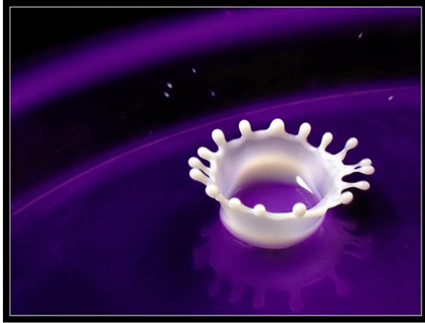
Dairy Queen 1/500" @ f/7.0 – ISO 100

In this photo, Danny used some creative lighting and a fast shutter speed to capture a beautiful splash crown.