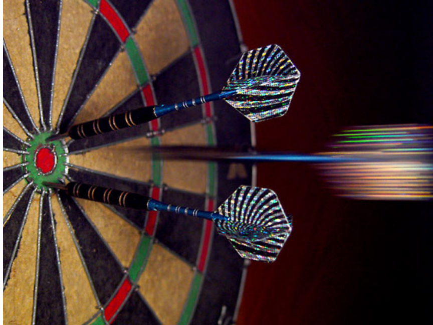
Hat Trick 1/125" @ f/2.2 – ISO 100

You can also use the same technique to create slight blurs. The shutter speed is faster for these photos but still slow enough to capture some motion in the photograph.